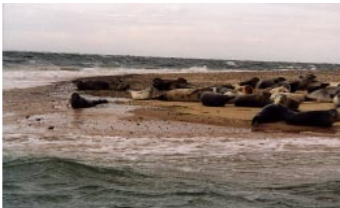
Harbour and grey seals at Blakeney Point, Norfolk, United Kingdom

foetal accumulation of PCB metabolites occurs also in pregnant seals (Murk et al., 1994; Brouwer et al., 1998).