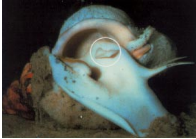
A female whelk from the open North Sea showing the development of a penis (imposex)