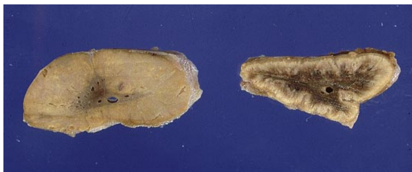
Transsected adrenal glands from a Baltic grey seal (left) and a grey seal from Svalbard (right) showing massive hyperplasia of the adrenal cortex in the Baltic seal

Despite a strong correlation to persistent organochlorine exposure, the underlying mode of action and the individual PCB and DDT compounds responsible for these toxic effects in Baltic seals are still incompletely understood. Given the diverse pattern of pathological lesions observed and the large number of organochlorines and metabolites identified in the seals, it is conceivable that the disease syndrome is caused by several classes of persistent organohalogenes and several independent mechanisms of action. Since there is often a covariation in the exposure to the different organochlorines, the eco-epidemiological study approach will generally not allow conclusions about the aetiological role of individual chemicals but at most about groups of chemicals. Eco-epidemiology may, however, direct attention to groups of chemicals. Recent studies have thus concluded that high concentrations of DDT compounds were present in reproducing females in the past, whereas females with high PCB concentrations failed to reproduce (Roos et al., 1998). These results support an aetiological role of PCB for parts of the disease syndrome, particularly for lesions connected to the reproductive failure among the seals.