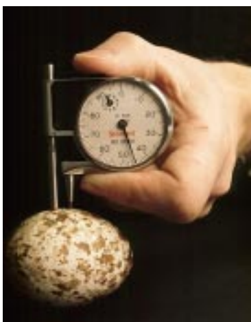
Measuring the shell thickness of osprey egg

Originally reported in peregrins, eggshell thinning has been described in a large number of species including raptors such as the osprey ( Pandion haliaetus ) and the bald eagle ( Haliaeetus leucocephalus ) (Koeman et al., 1972; Lincer, 1975; Odsjö and Sondell, 1982; Peakall et al., 1973; Ratcliffe 1970). Bignert et al. (1995) examined eggshell thickness in Baltic guillemot ( Uria aalge ) eggs collected 1861-1989. Along with decreasing DDT and PCB levels in the Baltic fauna since the 1970s, the eggshell thickness in Baltic guillemot has gradually improved. Notably, however, guillemot eggshells were still thinner in their recent material than in historical material collected before 1946.