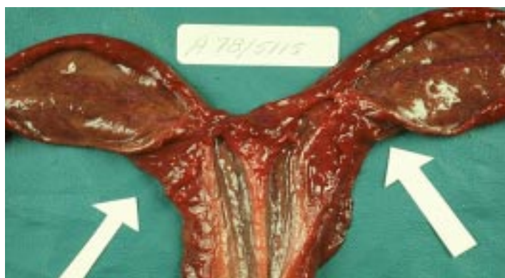
Uterus from a sterile grey seal showing lesions resulting from a disrupted pregnancy. Arrows depict sites of strictures and occlusions in the uterine horns, originating from aborted early embryos